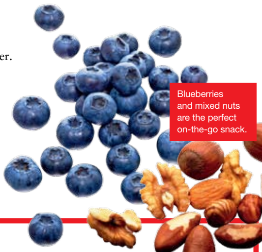
Blueberries and mixed nuts are the perfect on-the-go snack.

BODY PRODUCTS THAT WORK: "Every morning I complete an ancient Indian