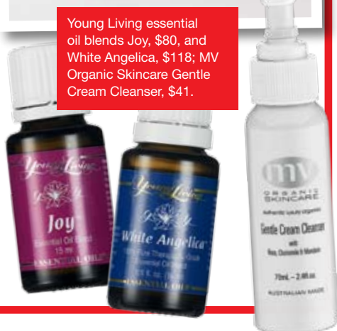
Young Living essential oil blends Joy, $80, and White Angelica, $118; MV Organic Skincare Gentle Cream Cleanser, $41.